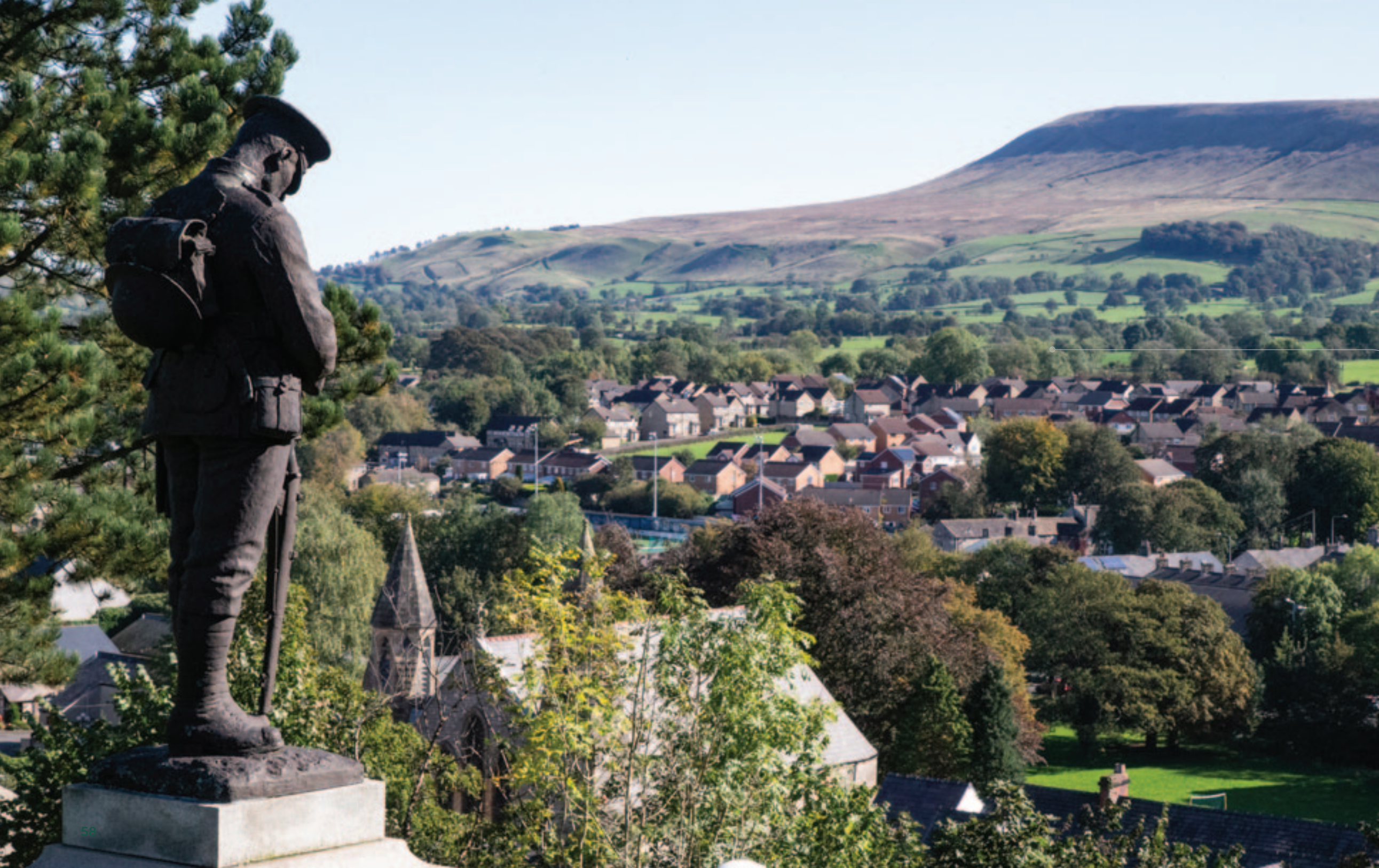
Ribble Valley is at the heart of the UK