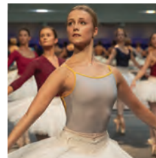
CHARLOTTE TONKINSON ARTIST OF THE ROYAL BALLET